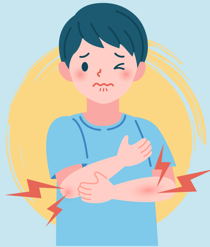
Pain, swelling and redness where the shot was given