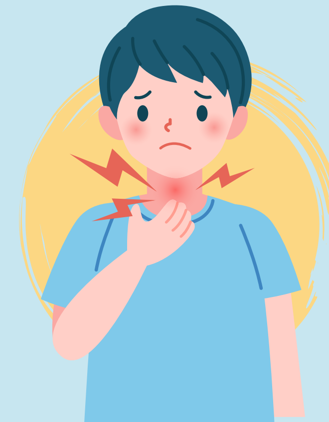
Swollen lymph nodes