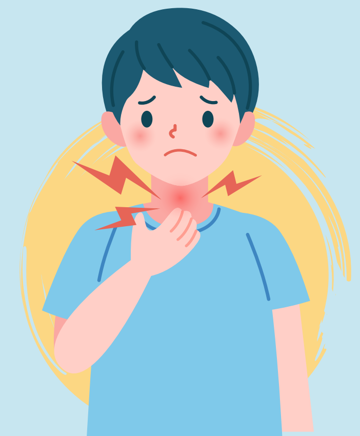
Swollen lymph nodes