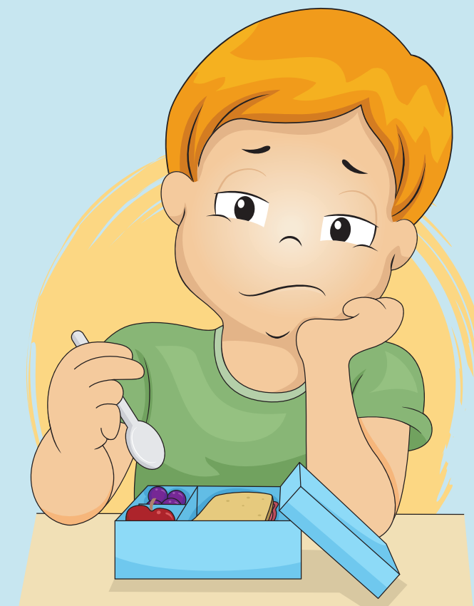
Lost of appetite