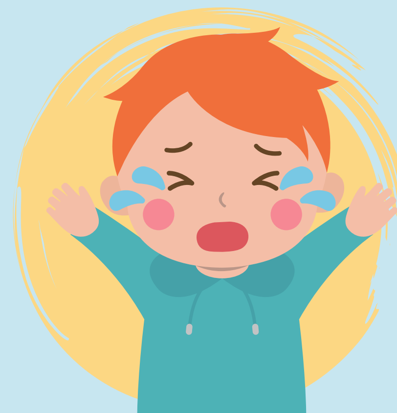
Irritability or crying