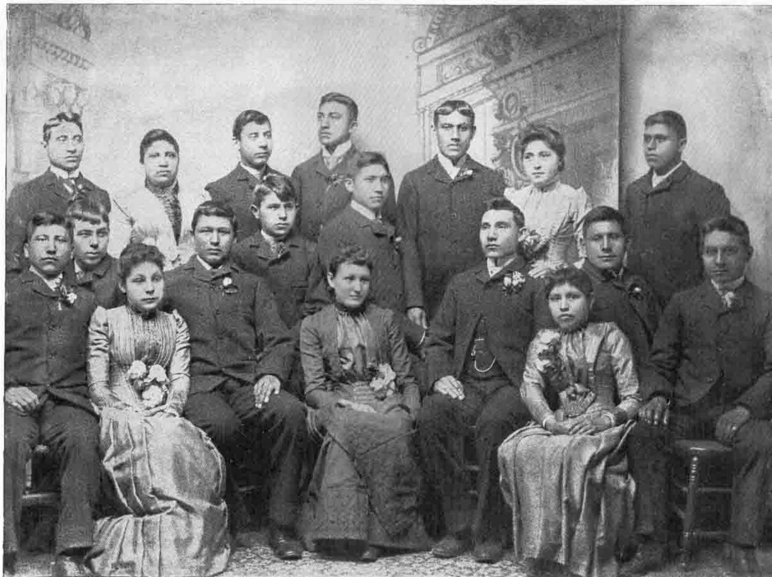
EDUCATING THE INDIAN RACE. GRADUATING CLASS OF CARLISLE, PA.